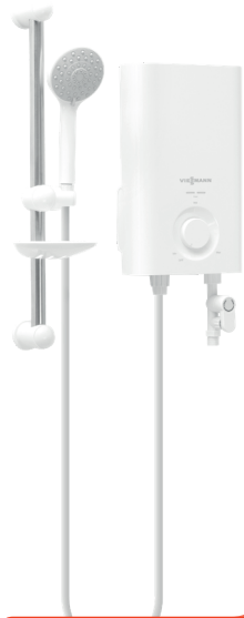
Classic Shower Accessories Included