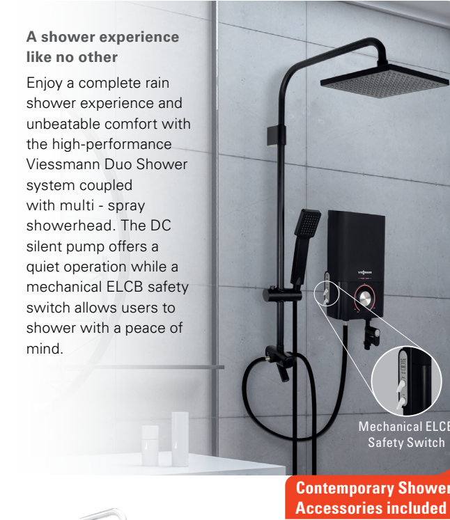
Mechanical ELCB Safety Switch

Enjoy a complete rain shower experience and unbeatable comfort with the high-performance Viessmann Duo Shower system coupled with multi-spray showerhead. The DC silent pump offers a quiet operation while a mechanical ELCB safety switch allows users to shower with a peace of mind.